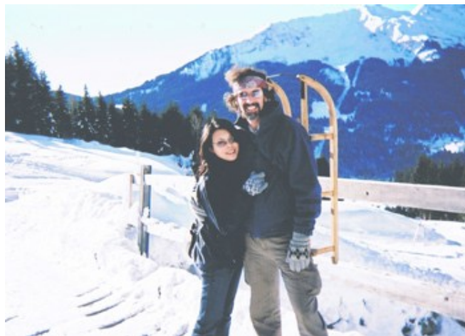
Christmas in Klosters, Switzerland